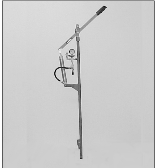
Sphere Removal Tool

FMC Technologies Measurement Solutions Sphere Removal Tools and hardware are manufactured to give the highest quality products available. The vacuum pump will develop 23 inches of mercury vacuum. All pipe fittings, check valves, pump cylinders and pipe sections are made from stainless steel to prevent rust and corrosion. The vacuum gauge is made of galvanized and painted steel.