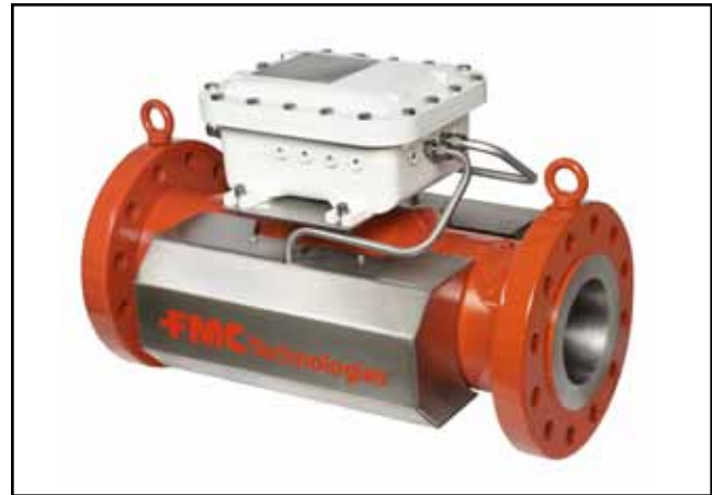
Transducer and cable protection covers are standard for UL/CUL units but are an option for ATEX units.