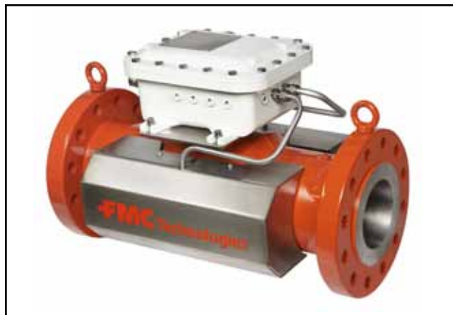
Transducer and cable protection covers are standard for UL/CUL units but are an option for ATEX units.

drift to provide long-term measurement stability independent of pressure, temperature, and transducer aging