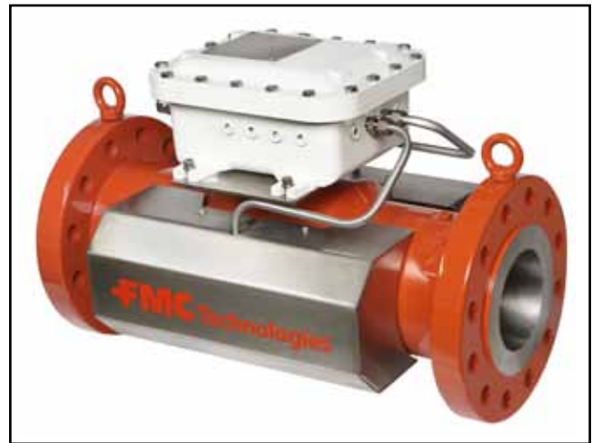
Transducer and cable protection covers are standard for UL/CUL units but are an option for ATEX units.