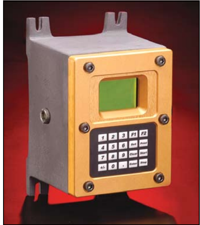
Smith Meter microFlow.net

Applications include any size gas pipeline for single product, single meter flow. This self contained EXP unit continuously computes, totalizes, and displays Gross, Gross at Standard Volume, Mass, and Energy. The microFlow also offers run time displays, which provide all (rate, batch, temp, etc.) critical flow information.