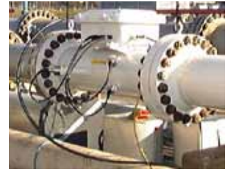
MPU 600 3 Path Ultrasonic Meter

MPU 200, 600, 800 and 1200 Gas Ultrasonic Flowmeters