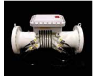
MPU 1200 6 Path Ultrasonic Meter

MPU 200, 600, 800 and 1200 Gas Ultrasonic Flowmeters