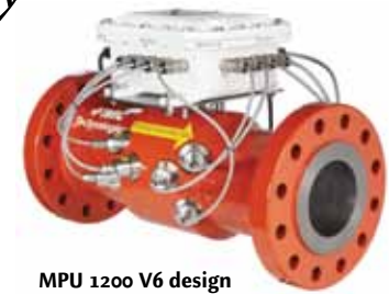
MPU 1200 V6 design Ultrasonic Meter

MPU 200, 600, 800 and 1200 Gas Ultrasonic Flowmeters