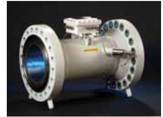
MPU 200 Single Path Ultrasonic Meter

MPU 200, 600, 800 and 1200 Gas Ultrasonic Flowmeters