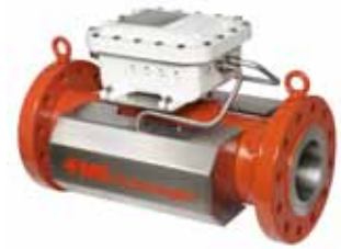
MPU 1200 Gas Ultrasonic Flowmeter Transducer and cable protection covers are standard for UL/CUL units but are an option for ATEX units.

MPU 200, 600, 800 and 1200 Gas Ultrasonic Flowmeters