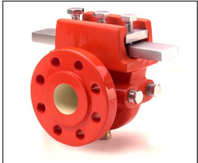
OrificeMaster Single Chamber Orifice Fitting