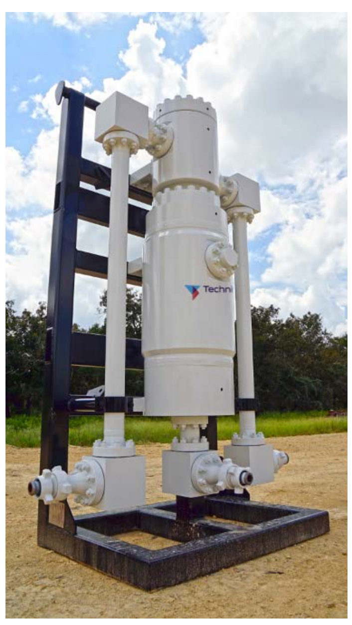
The Wellhead Desander is proven technology with a track record for both well testing (flowback) and production applications for hundreds of wells in all major US Shale plays with over 20 operators