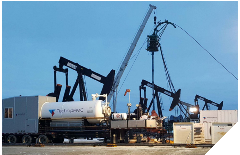
TechnipFMC's flow processing services on location.