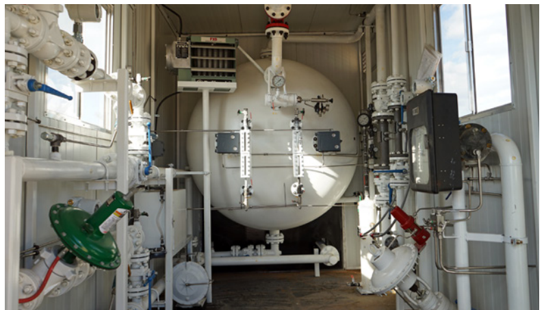
TechnipFMC's offers separator vessels for any size project.